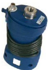
External IDOS universal pressure modul