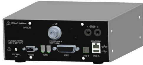
PACE 1001 from the rear