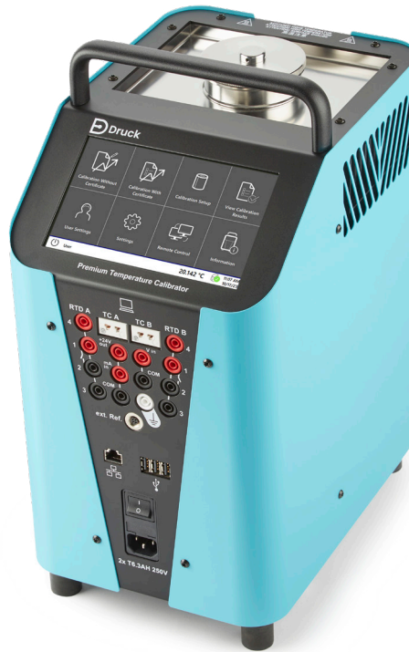
PTC165i Integrated measuring model